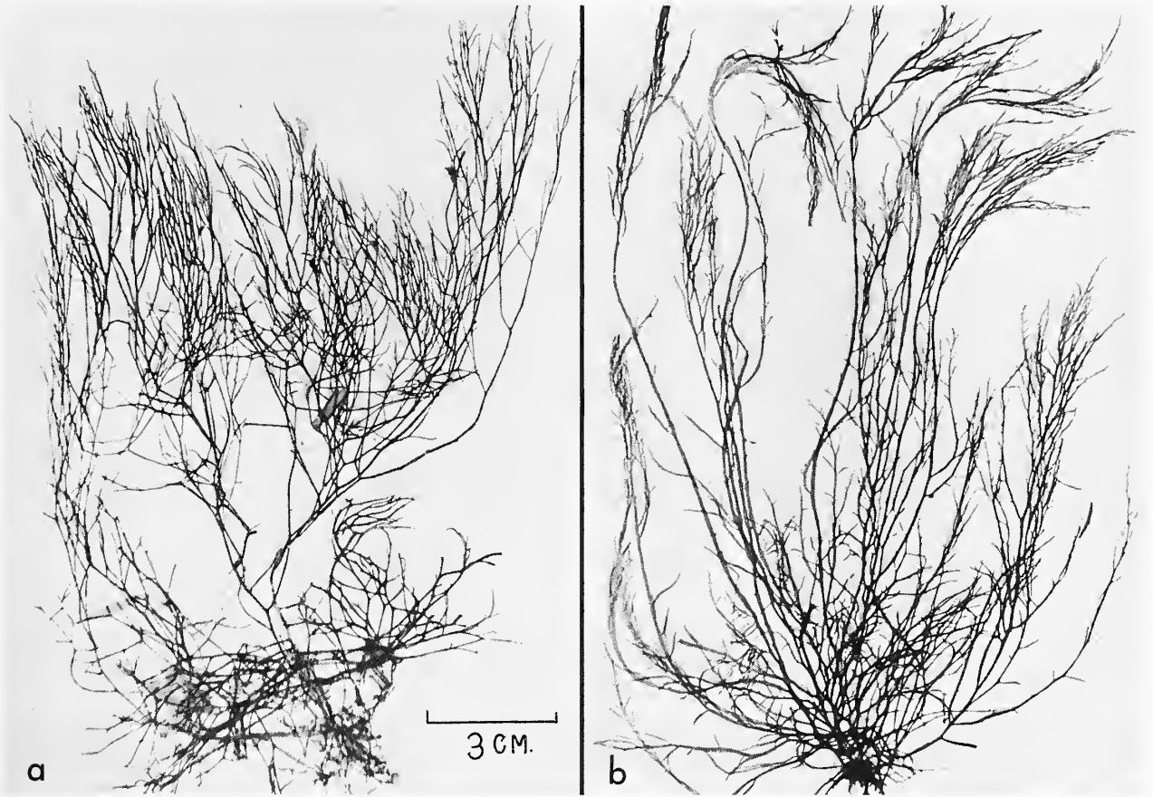
FIGURE 1.— Agardhiella tenera (J. Agardh) Schmitz: a , from a loose substrate of coarse granular material showing a loosely entangled basal portion and erect branches without dominant axes (plant from Tobago); b , from a firm substrate, the entangled base compact, the erect portions with distinctive main axes (plant from Dominica).

material, excluding reproductive structures not readily described from herbarium material. In short, the plants grow in colonies—if on a firm substrate, with compact fibrous bases felted together, if on broken shells or corals, with a loose open mat of fibers mingled with the surface material—and these groups of plants may come ashore in considerable masses inextricably entangled below, free enough above. As to habit, Figure 1 a shows a portion of a clump with the loosely entangled base below, and it is also an example of the habit where no well-defined axes develop. In contrast, Figure 1 b shows a portion of a colony with a densely felted base and conspicuous erect axes.